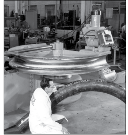
Pines Model 8 with Integral Damp Die for Large Radii