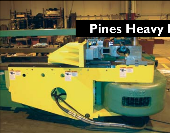
Pines No. 6 for Hot Bending

Pines specializes in custom Tube and Pipe processing machinery. Pines provides tooling, process technology, and tube bending solutions across a wide variety of industries.