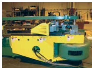
Pines No. 6 for Hot Bending